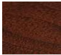
#400 American Walnut