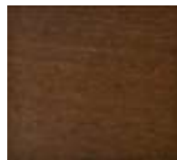
#400 American Walnut